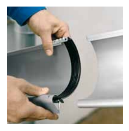
Gutter joint These joints are easy to fit, creating very firm, durable joints. The joints are guaranteed leak-proof with a long-lasting EPDM sealing.

This holder is made from only one piece of sheet steel and mounts a pipe with one firm grip. There are no accessories to be lost or mounted askew.